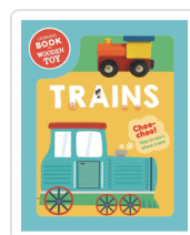
TRAINS-BOOK & WOODEN VEHICLE (ING) AA.VV.