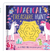
MAGICAL TREASURE HUNT (ING) AA.VV.