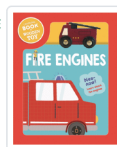
FIRE ENGINES WOODEN VEHICLE SET (ING) AA.VV.