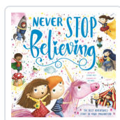
NEVER STOP BELIEVING (ING) IGLOOBOOKS